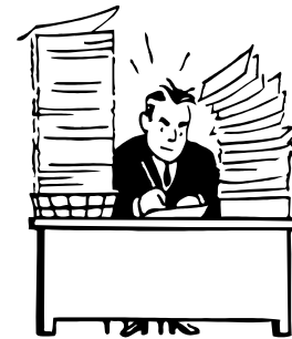
Too much work, too little time ?

Next Issue..... The latest trainings Stress Buster Tips Available resources